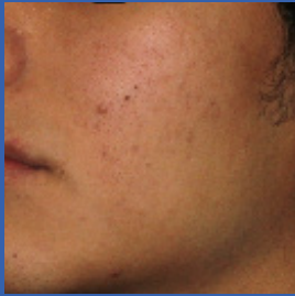
SIX MONTHS AFTER FINAL TREATMENT SESSION