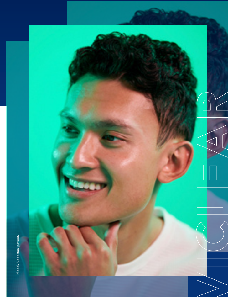
Model. Not actual patient.