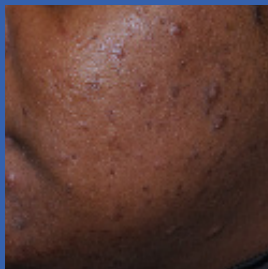
SIX MONTHS AFTER FINAL TREATMENT SESSION